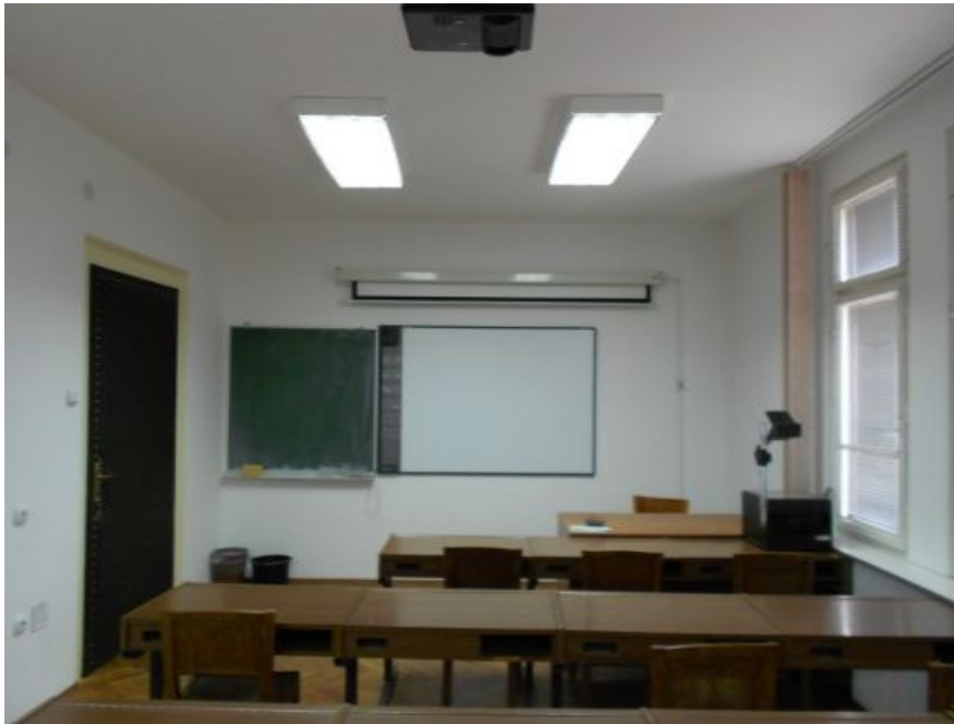
New books in library and new teaching equipment at TF Bor classrooms