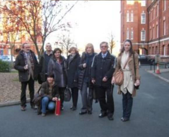
Details from mobility visits of TF Bor staff to different HE in EU