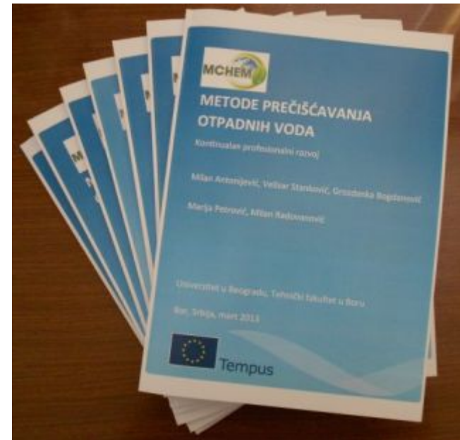
Textbook published in the frame of this CPD course